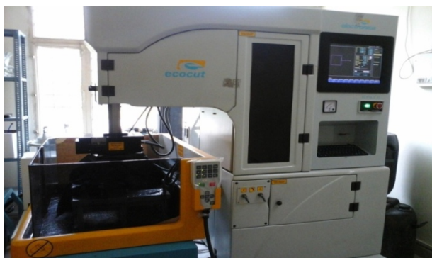
Figure 1: Experimental setup Wire Cut Electrical Discharge Machining