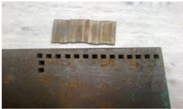
Figure 3: Work piece after Wire Cut Electrical Discharge Machining & profile in the form of bars