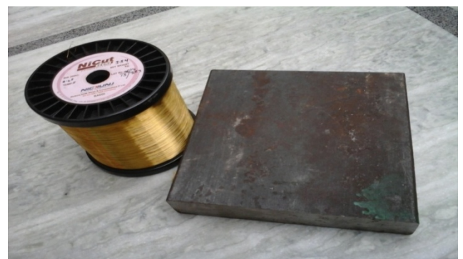
Figure 2: Work piece & Brass wire before Wire Cut Electrical Discharge Machining